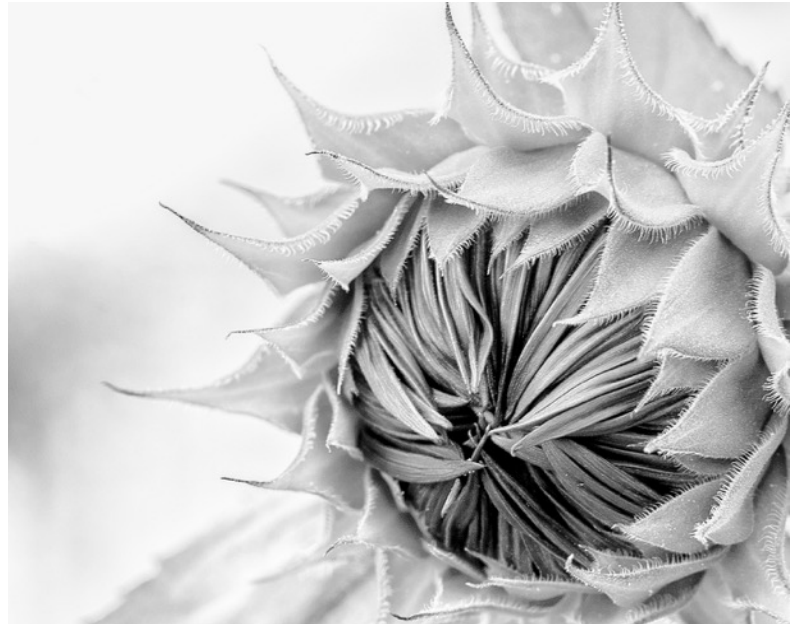
Name: Charles Zehnder Where: Home garden Camera: Canon 70D Lens: Canon 100mm f/2.8 macro Shutter: 1/30 f/stop: f/10 ISO: 400