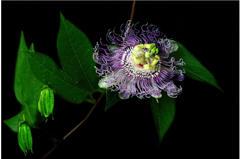
Name: Nancy Dawson Where: Midway, Kentucky Camera: Canon EOS Digital Rebel XTi Lens: Macro 100mm Shutter: 1/25 f/stop: 2.8 ISO: 100