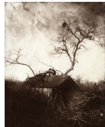
Reclamation, 2015 by Rick Lanning

William Henry Fox Talbot patented the calotype in 1841. It was the first photographic process that produced a negative to create a photograph. The calotype is the negative, typically produced on fine writing paper, although the resulting photograph is commonly referred to as the calotype. Because the photographs are made with a paper negative, the printed images tend to be soft and dreamy as the paper fibers diffuse the focus. The process appealed mainly to artists, amateurs, and scientists.