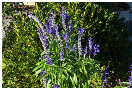
Where: Grandparents' backyard Camera: Nikon Cool Pix L22 Lens: NA - Built in Zoom Lens Focal Length: 13mm Shutter: 1/100 f/stop: f/4.4 ISO: 80

We wanted to give a special call out to high school student Amelia McKinney who was our 1st place winner in the Youth category for the flowers competition. We hope to see more from Amelia and any of our youngest members!