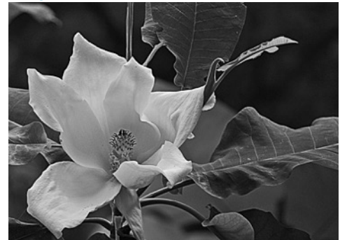
Above right Name: Claudia Banahan Where: Red River Gorge Camera: Nikon D-100 Lens: 70-300mm @300mm Shutter: NA f/stop: f/5.6 ISO: NA