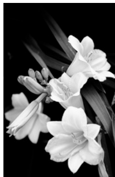
Above left Name: Raymond Bailey Where: Lexington Arboretum Camera: Nikon 7000 Lens: Nikon 18 - 200 mm @200 mm Shutter: 1/39 f/stop: f/5.6 ISO: 100