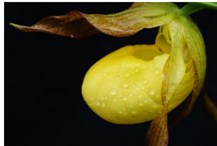
Above left Name: Eric Comley Where: Cumberland Falls State Resort Park Camera: Nikon D7100 Lens: Tokina 100mm f/2.8 Shutter: 1/100 f/stop: f/16 ISO: 200