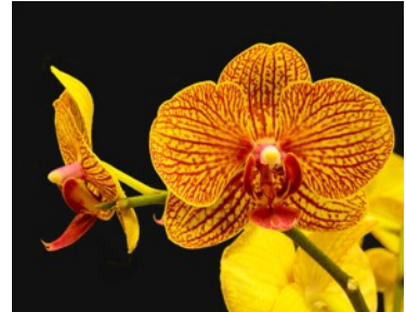
Above right: Name: Bill Cole Where: Lexington Camera: Canon T5 Lens: Canon 100mm macro Shutter: 2 sec f/stop: f/18 ISO: 200